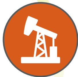
Brent Crude Oil