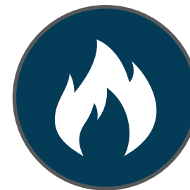
Liquid Natural Gas Market