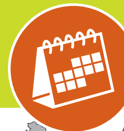
Time of the Year